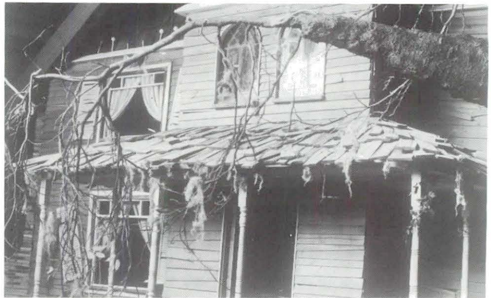
The Haunted House was built inside the auditorium at Des Moines Beach park.

Construction will be done in phases over the next year.